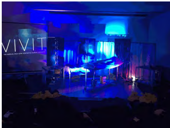
VIVIT experience at South Essex College Group of Year 12 and 13 Biology Students

We had the brilliant opportunity to visit the VIVIT experience, which showed a synthetic human cadaver dissection from the brain down. It was such an interesting experience as they showed organs (from pigs) and discussed ailments with expert terminology. It was a unique experience which furthered my interest in Biology.