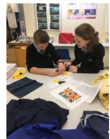
Pupils working hard, colour matching and preparing squares for our blanket for Crisis.