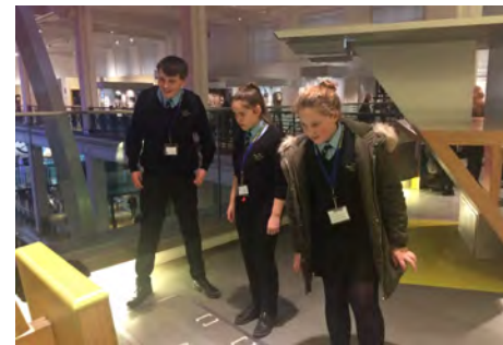
Exploring the Science Museum

Just before Christmas 30 Year 9 pupils spent the afternoon in London in the Science Museum where they interacted with many of the displays, learning about their genetics, engineering a moon buggy and exploring our social psychology!