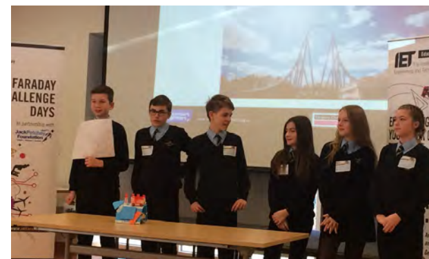
Completing the Faraday Challenge - designing a new attraction for Thorpe Park