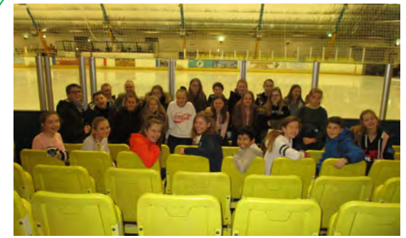
Year 8 pupils