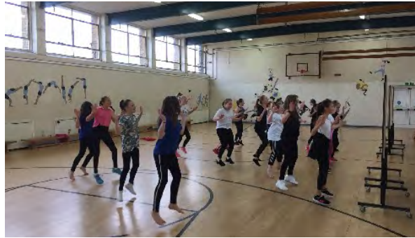
Learning New Dance Routines