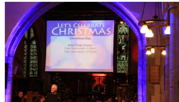
Carol Service at Holy Trinity Church