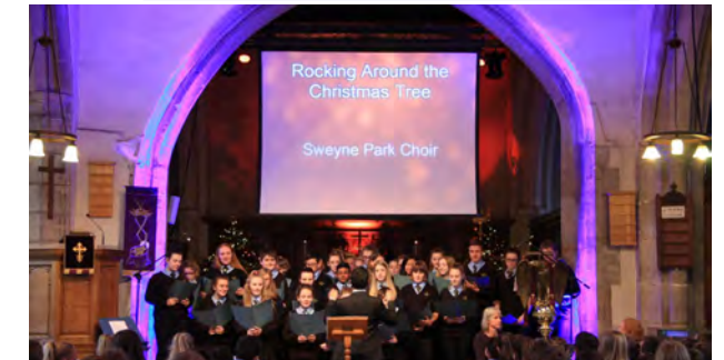
School Choir performing "Rocking Around The Christmas Tree"