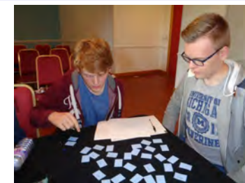
Wir suchen falsche Freunde (we're looking for False Friends)