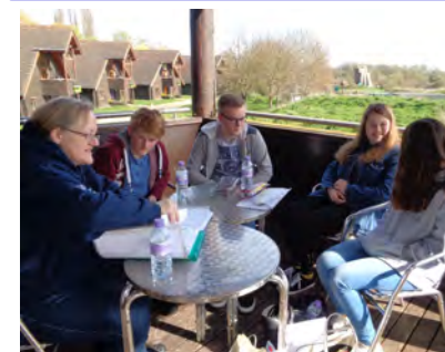
Schöner Ausblick, aber kalt! (Nice view, but cold)