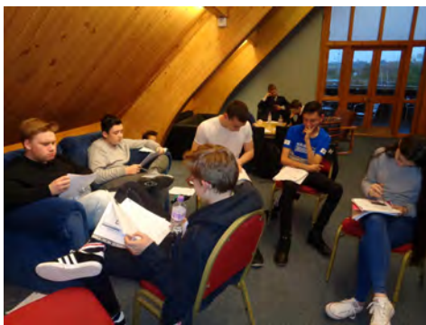
Improving our reading skills