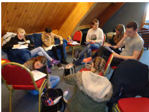
On a écouté les examens GCSE (we listened to GCSE past papers)