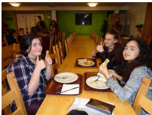
Le dîner était bon! (Dinner tasting)