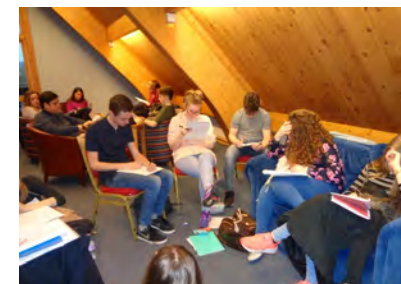
Hard at work! Totally concentrated...