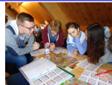
Wir sind Detektive (we are detectives)